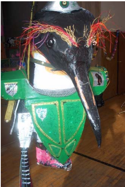
Piñata - December 2006

The Randolph School is founded on the belief that all children have a natural desire to learn. This desire is supported and nurtured in an environment in which each student's needs and interests are respected. Mutual trust between children and adults creates an atmosphere where students are encouraged to discover and explore their world. Work and play are focused on experiential, hands-on learning that is developmentally appropriate. We strive to balance the creative potential in the intellectual, social, emotional, artistic, and physical lives of children and young people. We believe that children who love to learn become life-long learners.